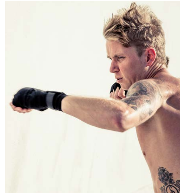
LEFT Get active, decompress and have fun with brite spokes' Love. Fitness. Happiness program.