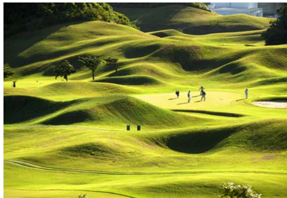
RIGHT Take on two championship, 18-hole golf courses with brite spokes' Boys Will Be Boys Par 1 package.